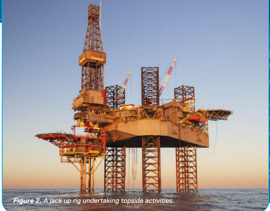
Figure 2. A jack up rig undertaking topside activities.

Materials may be placed within the well bores during the activities, including cement, drilling mud, gels and other non-porous materials such as clays (e.g. bentonite) and other sealants (e.g. bismuth, resin) or lost